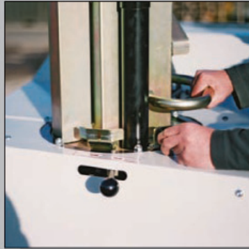
360° Mast rotation.